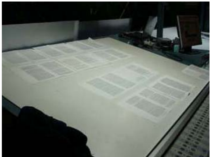
Preparation and checking first pages