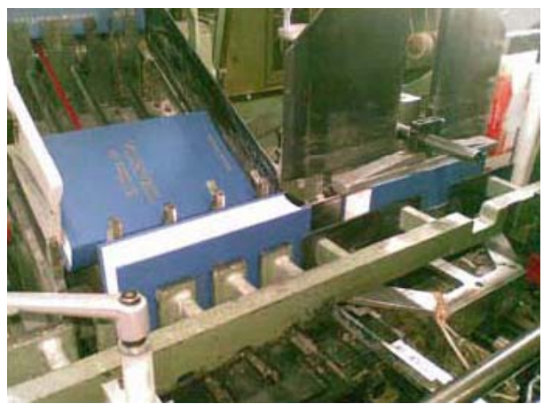
Shrink-wrapping the books for distribution