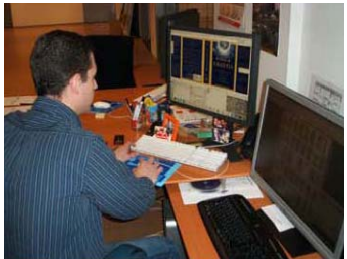
Pre-press operation and plates flashage