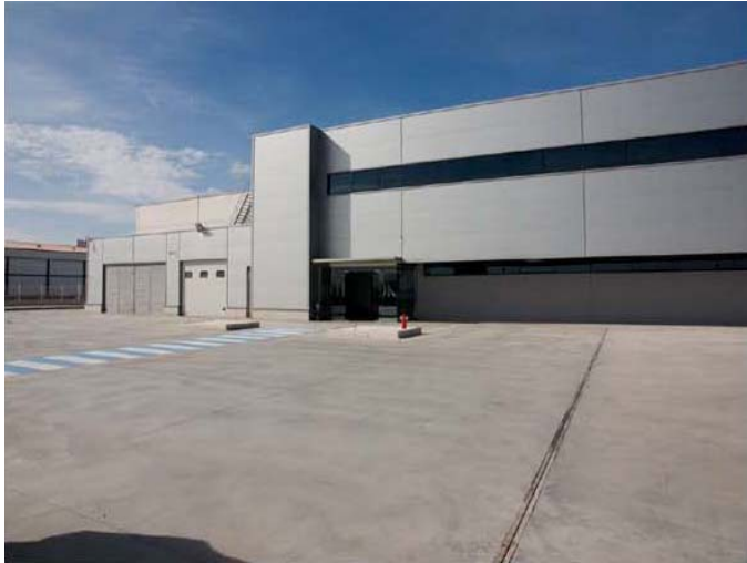
Rotabook Printing Mill