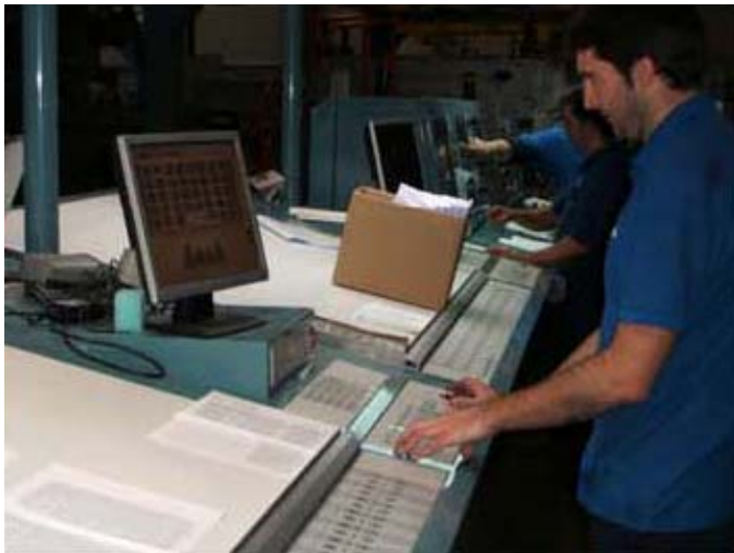
Preparation and checking first pages