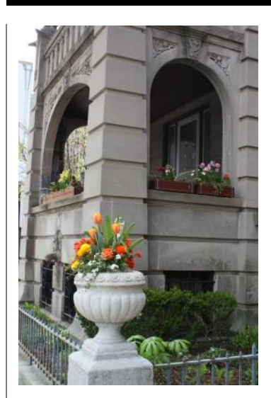
533 W Diversey Parkway