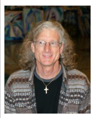
By James Woodward, Team Captain, Placerville, California, USA

In only a few short months students of The Urantia Book worldwide have embraced the new Study Group Portal. Readers now have online access to over 200 study groups in 24 nations!