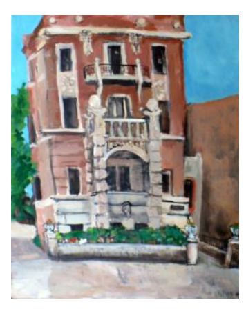
533

multi-day meetings at the Foundation's headquarters in Chicago. This wonderful building, the birthplace of the Urantia Revelation, is becoming an increasingly important center for various groups working for the Urantia Book project.