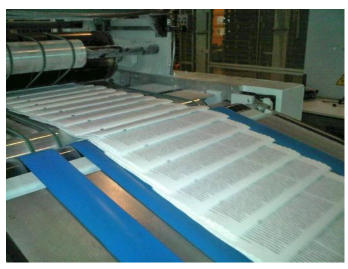
Hot off the press! The Hungarian translation being printed.