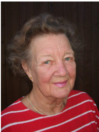
By Irmeli Sjölie, Associate Trustee, Helsinki, Finland

Editor's Note: Over seven nights and six days, from December 3 – 9, 2009, the Melbourne Parliament welcomed over 6,500 people representing over 200 religious and spiritual traditions from more than 80 countries. Attendees chose from over 550 programs, including daily observances, intra- and inter-