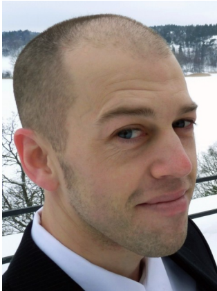
By Jacob D, Stockholm, Sweden

Ask anyone who lives in Sweden, and they will agree with the statistic that Sweden is the most atheistic country on the planet. It is the secular capital of the world, and by "secular" I mean "life without the presence of God." God has been pushed out of everyday living. A number of Sweden's public figures even boast that religion is a dying aspect of humankind's superstitious age, that religion is nearly removed from this ideal humanistic society, and the daily drone of religion-bashing goes on in newspaper articles. In fact, the Swedish people have gone so long without religion as a topic of